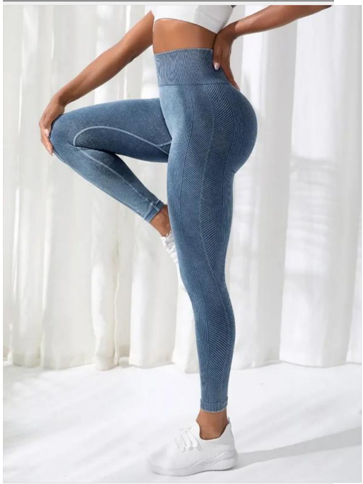
Jacquard Weave Full Length Leggings Parameter (Specification)