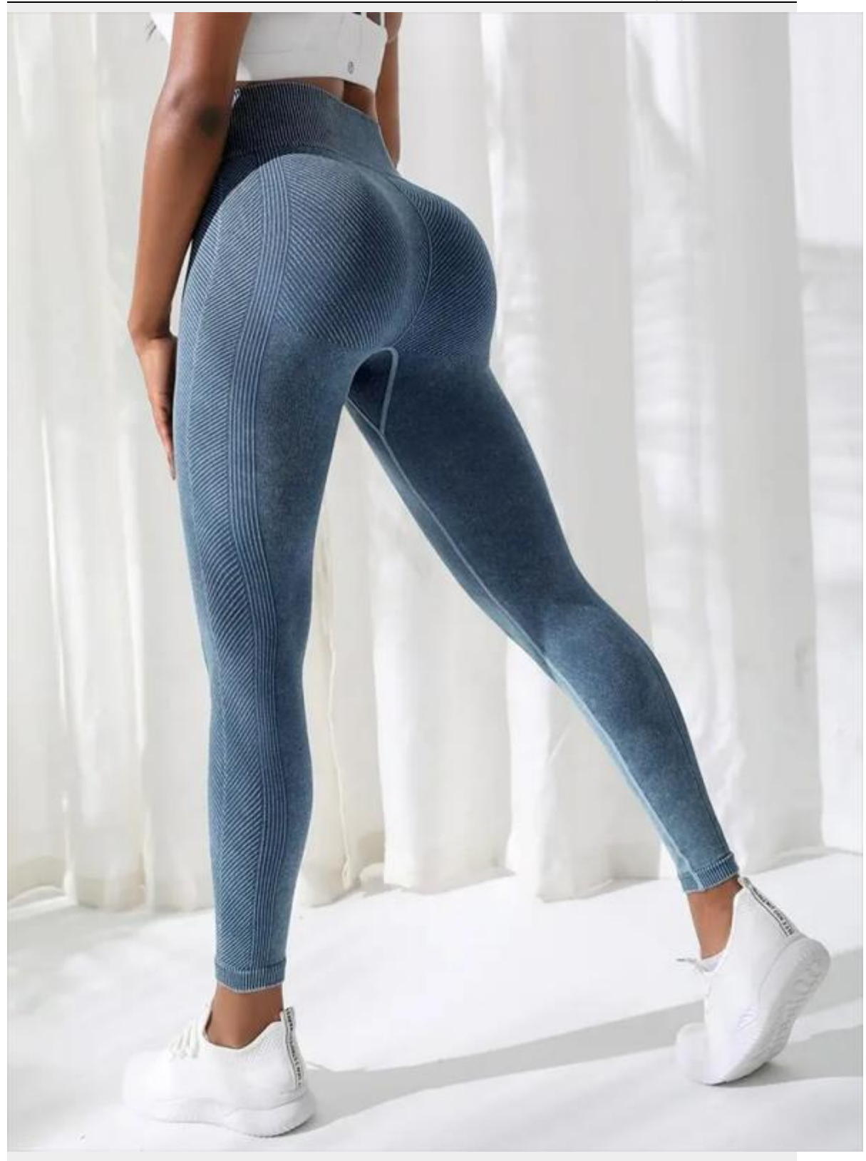
Jacquard Weave Full Length Leggings Product Introduction