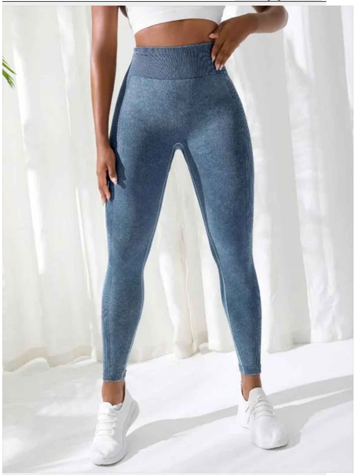
Jacquard Weave Full Length Leggings Feature And Application